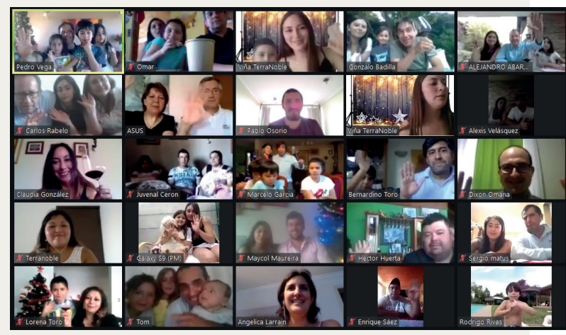
TerraNoble's team virtual Christmas

We are about to close the year 2020 and with optimism we look forward to the new year. Despite the uncertainty and difficulties we faced, the TerraNoble team did its best to continue operating normally, staying close to customers and consumers, assisting them in any way we could and sharing our good news.