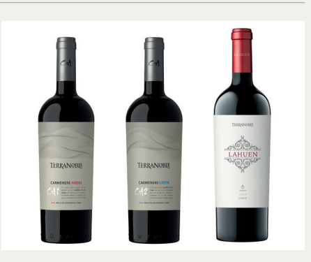
New packaging for Lahuen and Carmenere CA wines